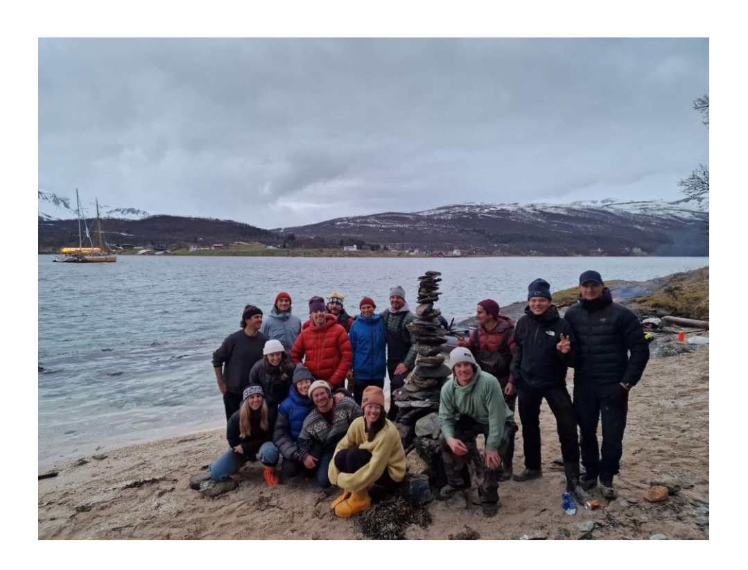
Day 2: Skiing in Reinoya or Ringvassoya